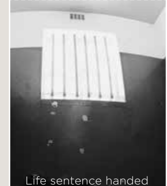
down at Rivonia Trial, after being found guilty of sabotage, conspiracy and assisting an armed invasion.